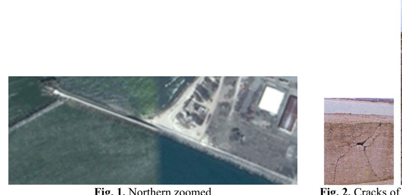
Fig. 1. Northern zoomed (from Google Earth application)

The object for experimental investigation is Northern piers of Klaipeda State Seaport (Fig. 1) in the period of 2014 - 2016. General characteristics: the structures are of inclined dams, reinforced by stones, concrete slabs and tetrapod; the pier is 733 m long, built in 1834-1858; reconstructed in 2002. When inspecting the piers construction cracks of the concrete surface at the object were found (Fig. 2). The crack-gauges "Geosense VWCM4000" with accumulator "Wi-SOS400 VWNode" were located in places: A where crack's width is about 7 mm; B – 10 mm (Fig. 3). Instruments were calibrated before measurements and the required accuracy \pm 0.1 % of measured value was fixed. The points were observed once per 24 hours; at night time – on 0.00 hr.