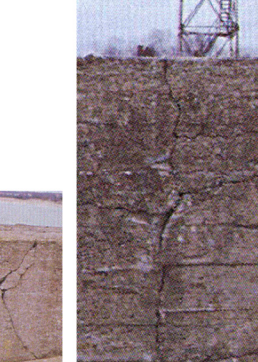
Fig. 2. Cracks of the concrete surface at the object