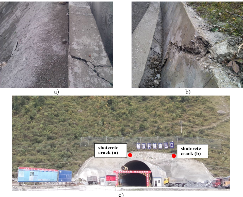
Fig. 3. Tracking for construction risk of tunnel portal

The cracks were produced at many places at the surface, slope and primary supporting of tunnel with small-scale collapse after the portal excavation of Jiefangcun Tunnel (see Fig. 3). After the risk analysis and assessment, the following treatments were adopted to guarantee the construction safety: (1) the grouting reinforcement towards surrounding rock of tunnel portal was used; (2) the advanced grouting with small pipe was added to reinforce the forward surrounding rock; (3) the surface of tunnel ceiling was covered with striped cloth, and the net-suspended spraying was conducted to close the cracks; (4) the bias open cut tunnel was built; and (5) the temporary invert was added.