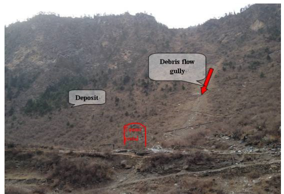
Fig. 1. Realistic picture of Jiefangcun Tunnel

The attribute recognition model of risk assessment for slope stability at tunnel portal was adopted to evaluate the slope stability of portal section D1K191+035 of Jiefangcun Tunnel (see Fig. 1). The diagram of tunnel geography is shown in Fig. 2.