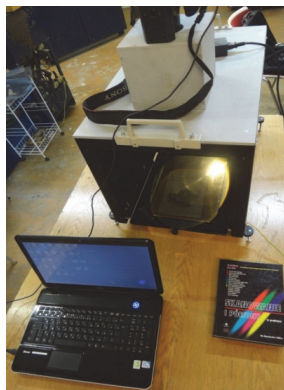
Fig. 2. The optical experimental setup of the shadow moiré system

A general view of the optical experimental setup comprising digital camera and shadow moiré system is shown in Fig. 2. A shadow moiré system contains of an incident light source (Fresnel lens), a grating of pitch g = 0.5 . A grid of dark and transparent stripes is projected onto the surface