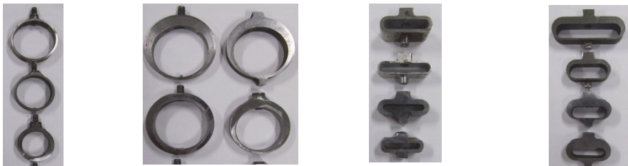
Fig. 4. The shapes of elastic concentrators

For experimental analysis four types of elastic concentrators were manufactured as presented in Fig. 4. Two types of them are circular shaped – with constant and variable cross sections and the other two are of closed loop shape with two parallel sides with constant and variable cross sections as well. All the concentrators were made of steel 45 as this material satisfies the necessary requirements: it has sufficient elasticity characteristics, ensures the possibility to transfer mechanical oscillations in ultrasonic range, has sufficient strength, and ensures reliability, good technological properties of the system.