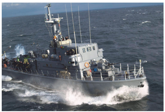
Fig. 1. Research object under tests [5]

histories, for each combination –point/direction/rotational speed. The mean value and standard deviation were calculated for each combination and each of the calculated characteristics, separately for usable and unusable shaft lines. Next, characteristics of time histories were calculated in the time domain: integral, mean value, energy, mean power (rms squared), simple moment of I order, simple moment of II order, central moment of I order, central moment of II order, normalized central moment of I order and normalized central moment of II order, abscissa of the signal square center of gravity, variance of the signal square and the signal equivalent mean value. It was established that the characteristic is of concentrated type for standard deviation lower than 15 % of the mean one. On this basis, an abscissa of the signal square gravity center, variance of the signal square and the normalized value of the signal correlation function were determined. A module and the sum of standard deviations were calculated from the difference of mean values for usable and unusable shaft lines for each combination and characteristic.