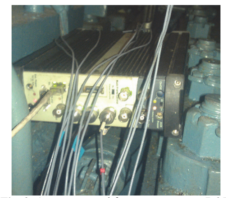
Fig. 3. Apparatus used for measurement s B&K 3560-B-120

This provided the basis for inference whether a given characteristic is reliable, that is, whether the module from the difference of mean values is higher than the sum of standard deviations.